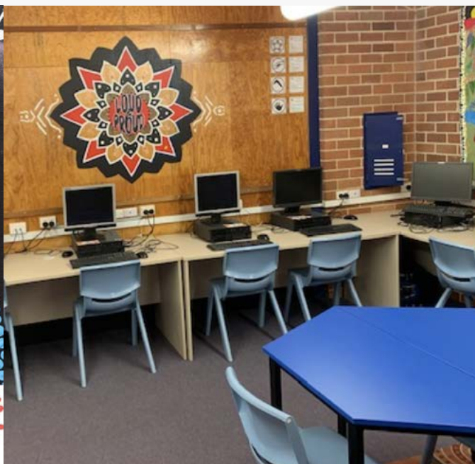
Image: Wattaka (Wonnarua word for 'meeting place') our Aboriginal and Torres Strait Islander Learning Space in our School Library.