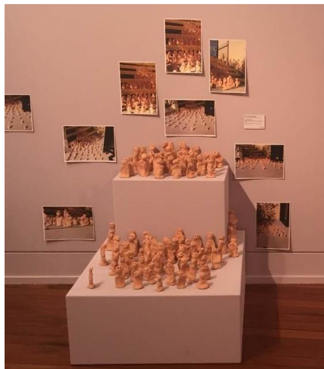
Year 12 Group work